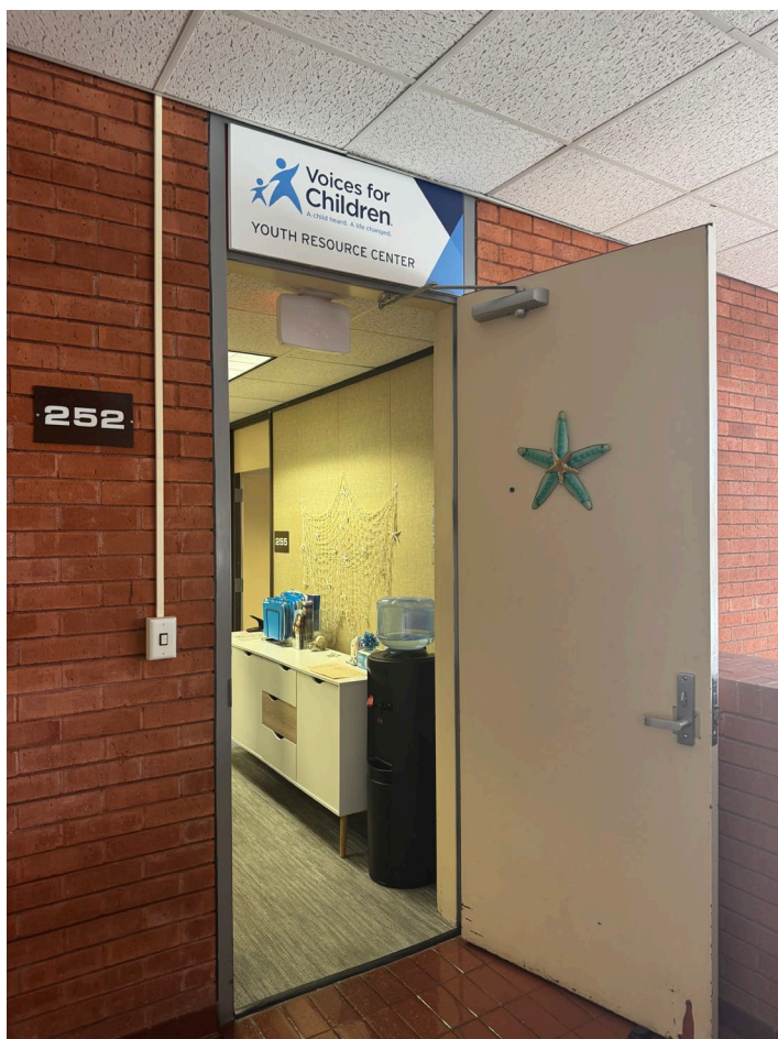
Voices for Children office inside the courthouse.