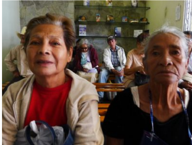
These patients in the waiting room recently had their sight restored

Visualiza, through its Guatamela City clinic and its Pescatore clinic in San Benito, performs 20% of all cataract surgeries in Guatemala. Patients receiving subsidized services pay $65 per cataract surgery. Through donations from SEVA (including money given to SEVA by Focusing Philanthropy) and other donors, Visualiza is able to offer free services to patients who otherwise would be unable to afford the $65 fee. These patients live in the most vulnerable conditions, as they are generally unemployed without any prospect of gaining employment due to their visual impairments.