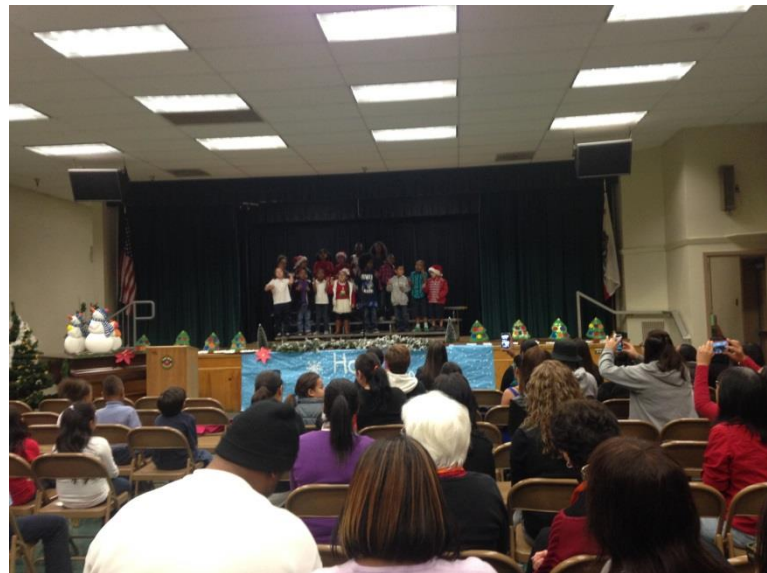
A group of LEARNs students, some also in Reading Partners, perform a holiday song. Proud parents, teachers, and volunteers cheer on the students and record the performances.