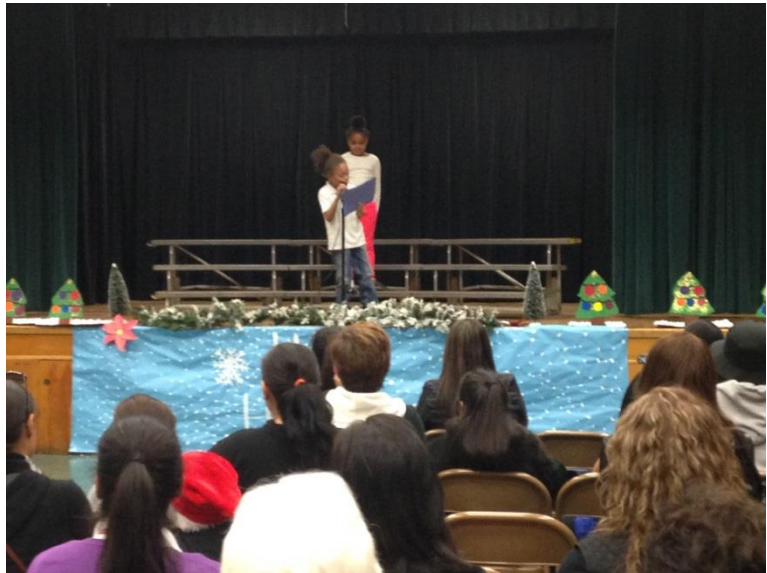
Two Reading Partners 2nd graders read a short poem about building a snowman.

Reading or speaking on stage, through a microphone, in front of over 100 people, including peers and family, can be a nerve-racking experience for many literate adults, let alone elementary students with a pattern of falling far behind in their reading skills. The enthusiasm and confidence displayed by the Reading Partners students was evident and impressive. Applause, high-fives and other encouragements followed each poem. When one soft-spoken student became stuck on a line, a peer on stage helped to sound out the words and her get back on track. Those two received the biggest applause. It was clear from the interactions between the Reading Partners Site Coordinator (an AmeriCorps member) and the students that they had developed a great rapport during the fall semester. While most of the students in the audience squirmed during the song performances, they were unusually still and quiet during the poems, clearly very interested in their classmates. This must be very meaningful to the Reading Partners students who braved reading to a large crowd, and helped to impress upon all in attendance that reading is fun and is to be celebrated.